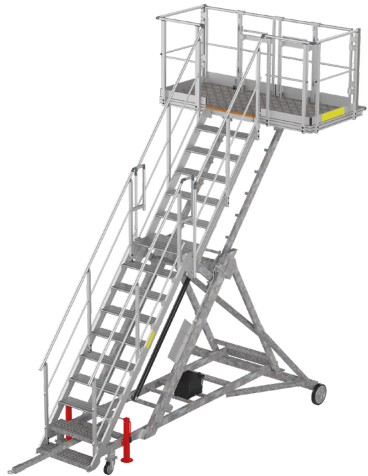
3D front view of the platform

Mobile height-adjustable and towable platform for PAX DOOR access. Aluminum structure mounted on galvanized steel frame.