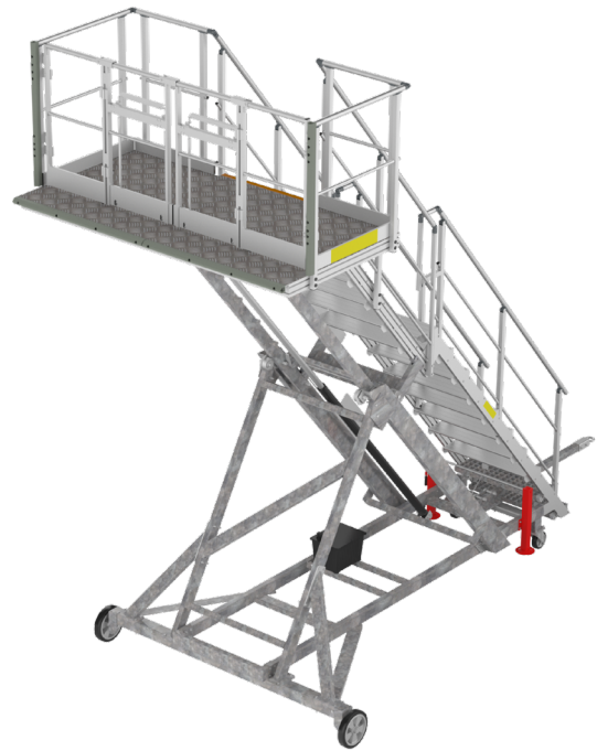
3D rear view of the platform