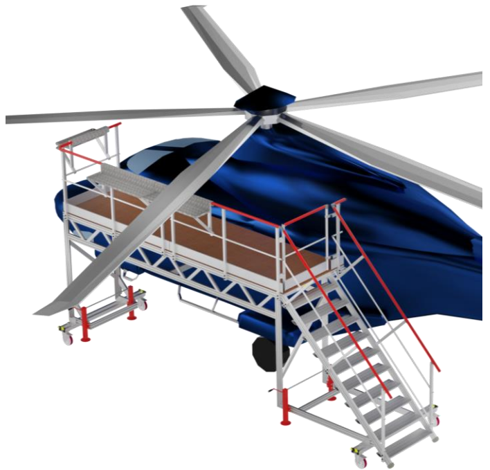
3D view platform in use position