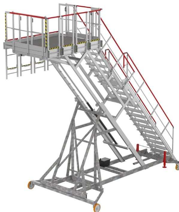
3D rear view of the stepladder