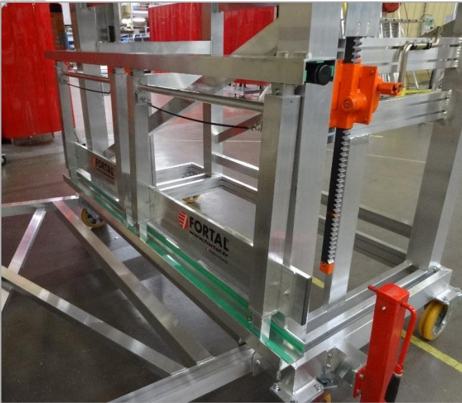
View on rack winch system for variable angle staircase and immobilization cranks.