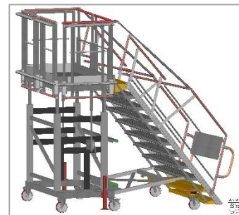
Stepladder in height position

Mobile stepladder for emergency slide access in raw extruded aluminum 100 x 30 mm