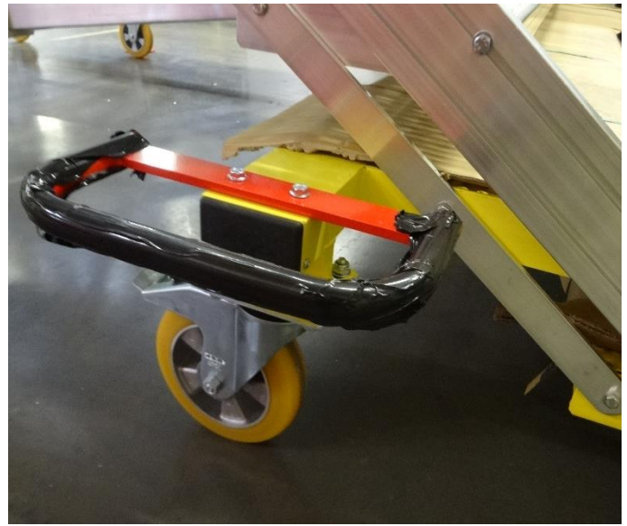
Ø 200mm swivel wheels with brakes at the front and sides and fixed at the rear Polyurethane tyres (for workshop or outside) with curving profile for easier moving.