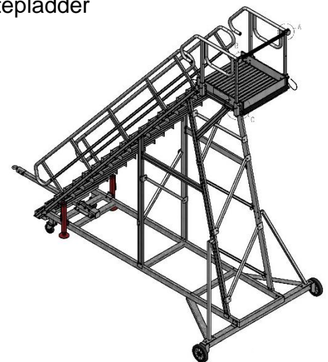
Rear view stepladder