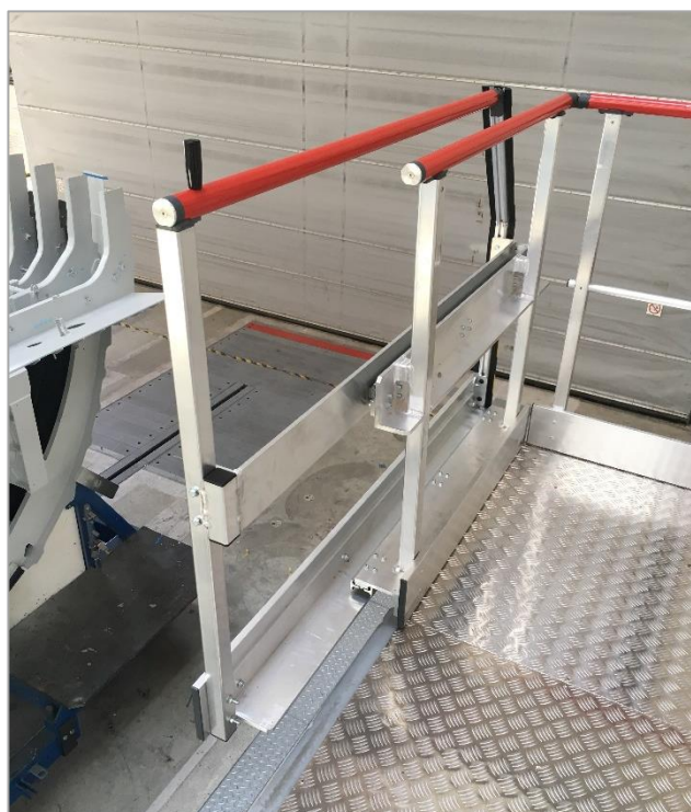
« L » shape flat sheet platform thickness 4.4 mm with platform. Rails and guardrails composed with red lacquered handrail (RAL 3000), intermediary rail and baseboard. Horizontally sliding guardrail in 2 sections 1500 mm total length. Manipulation with handle, in folded position locking with magnets. Gap bridges for all aircraft types adaptation.