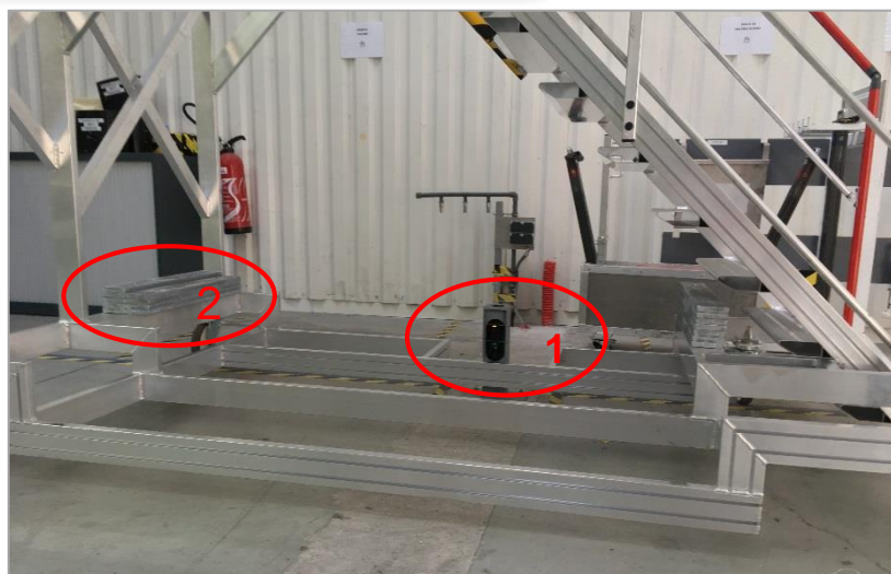
Lower frame to avoid the laser beam cell (1) Counterweight (2) for better stabilization during stepladder use.