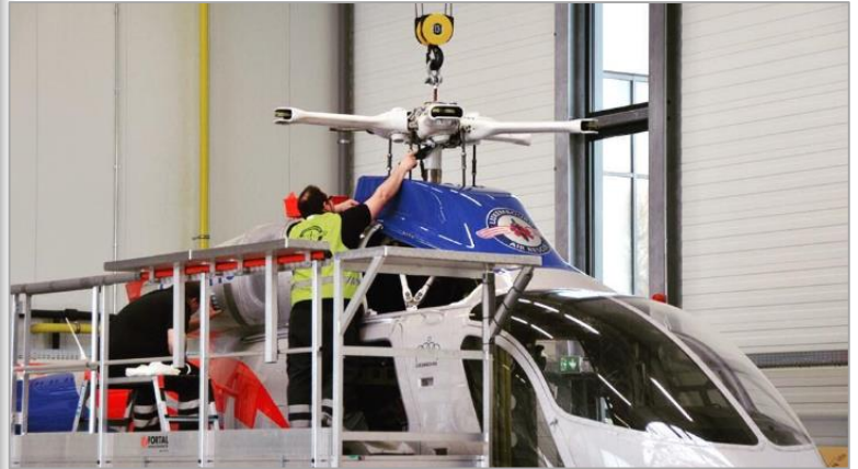
Platform in using situation