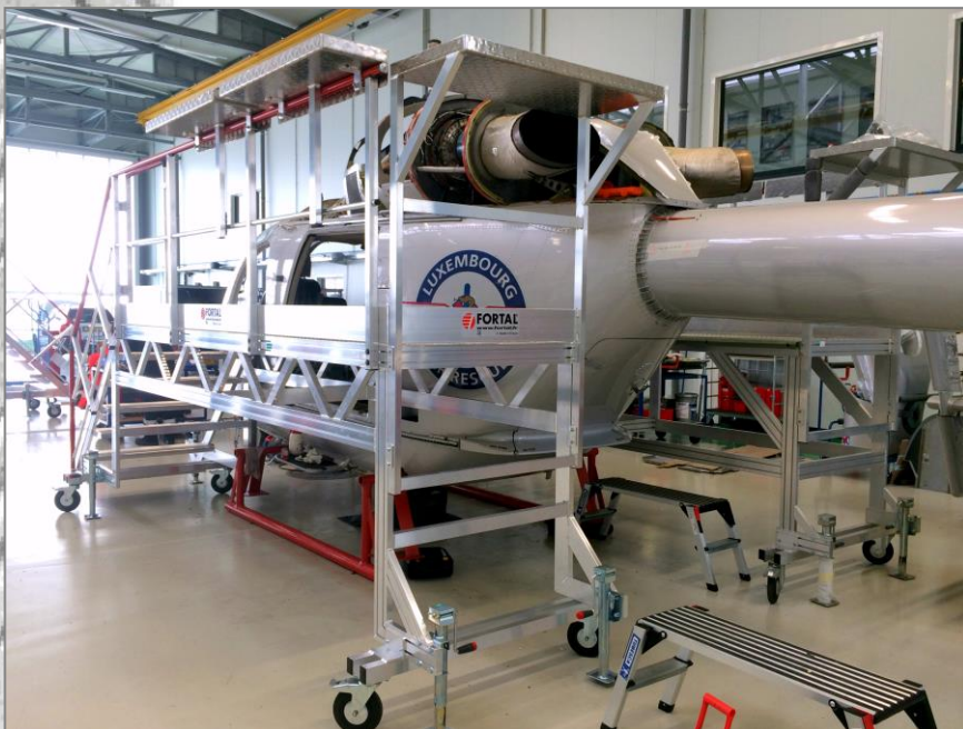
Easy moving and installation thanks to 4 wheels Ø 200 mm and 4 immobilization cranks.