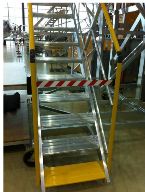
Yellow lacquered first and last step

Galvanized steel frame - platform dimensions 4.5 x 3.6 m – coating wood height adjustable from 4.5 to 5.8 meters by hydraulic cylinders and hand pump sliding guardrail on the platform to allow loading and unloading equipment total weight : 2.2 tons - easy to move only 3 men swivel brake wheel Ø 260 mm. Operating load: 750 kg