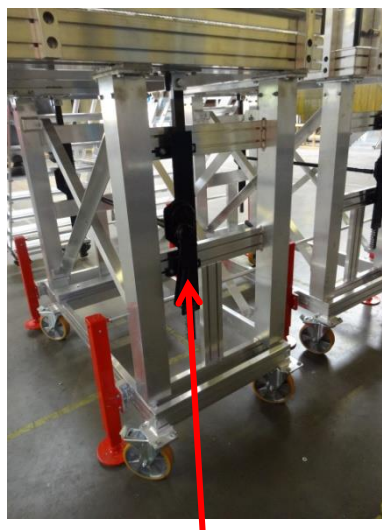
Rack system which allows the height adjustment of the platform