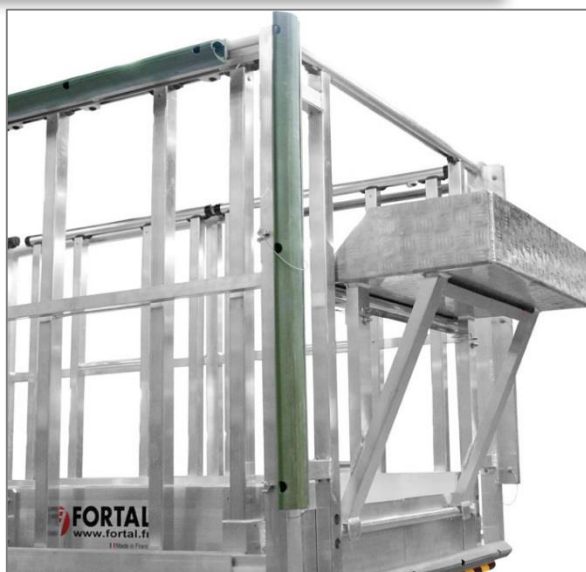
Removable tools holder tray