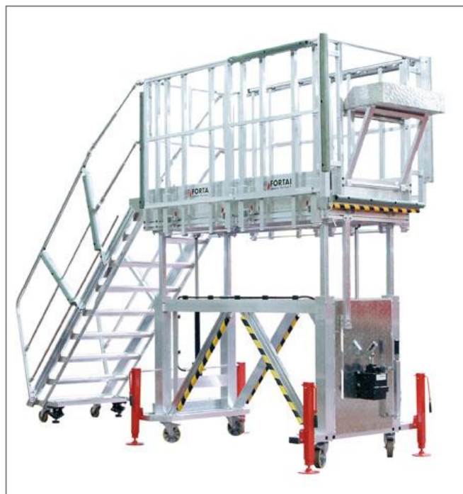
Platform in high position