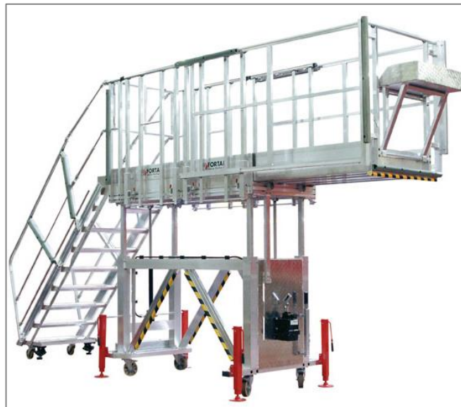
Platform in high position – working surface extended