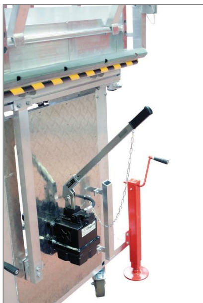
Hydraulic hand pump system and crank stabilizer

Variable angle stair with aluminum anti-slip ribbed steps depth 261 mm